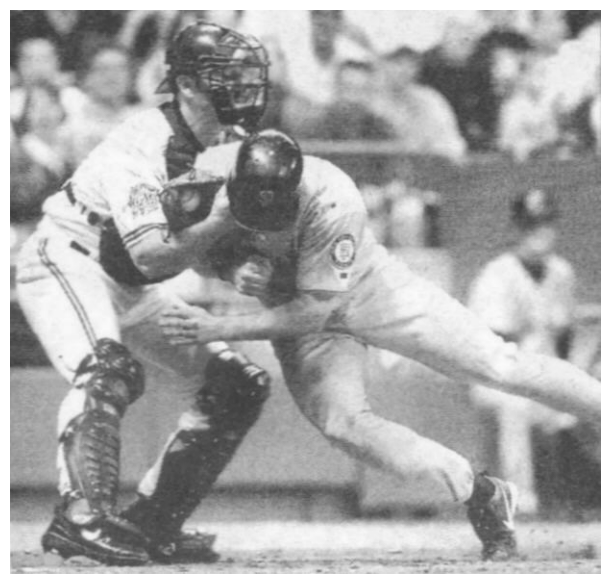
FIGURE 1. Possession

Not a whole lot of interpretation involved with Figure 1 . The catcher clearly is in full possession of the ball and the runner's intent is pretty obvious. Although this is "good, hard professional baseball," it is definitely a violation of the NWIBL No Collision Rule. If you ever witness this play, and regardless of whether the catcher (or any defensive player) was able to hold onto the ball, the runner should be called out and, in this case, ejected from the ball game. A "no-brainer" for any umpire.